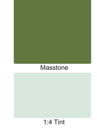
Total Solar Reflectance of Masstone = Approximately 40%