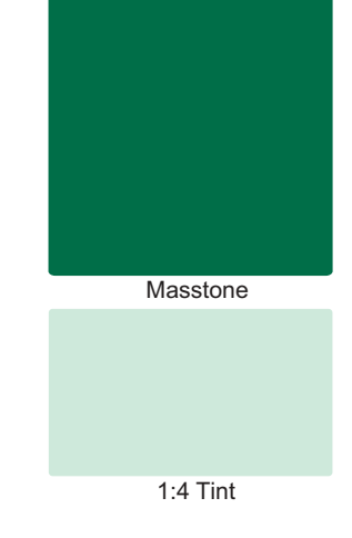
Total Solar Reflectance of Masstone = Approximately 28%